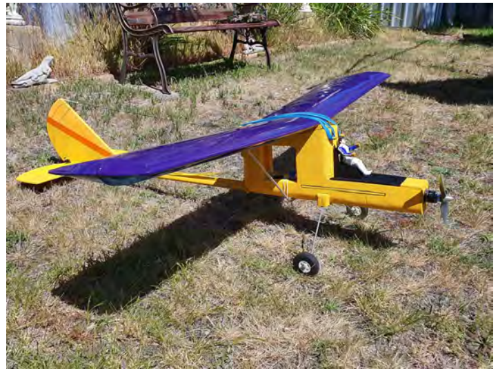
The maiden flight was not all that successful, after getting into the sky it wing tip stalled and the balsa rod fuselage broke. Back to the drawing board.

This is what I came up with, the front section was constructed out of some medical foam transport eskies and the wing was something I found on the rubbish tip at the field, however, it had to be recovered.