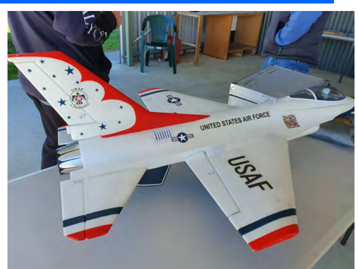
The Arrow Viper is becoming a popular little 50mm EDF jet with some members and a whole lot of fun to fly, for it's size it is a nippy little flyer.