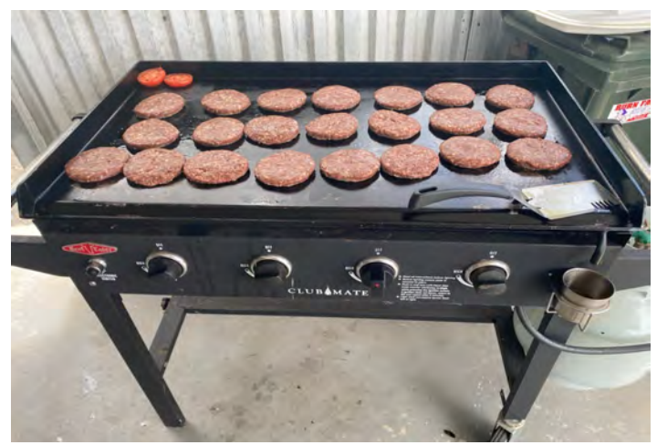
When the word got out about the quality of the burgers the line extended outside the clubroom waiting to partake in one.

Approaching lunch time and the patties were lined up on the BBQ ready to feed the first of the hungry attendees.