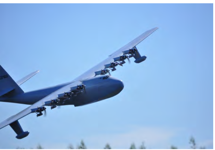
To trying his hand at this much smaller electric ARF model.

Due to his failing health he has gone from this the Spruce Goose one of his first large models fitted with eight engines..