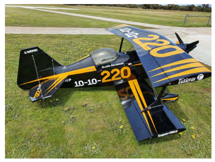
It is a well presented scale model with a lot of detail taken into consideration during the build.

Glenn has been recently flying this monster around which presents very well both on the ground and in the air.