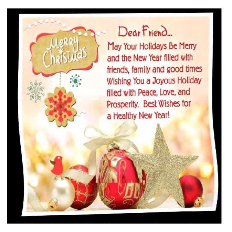
It's all fun and games until Santa checks his naughty list.

Have you heard this quote before, or used it close to Christmas, with Naughty kids. "That's it I'm calling Santa."