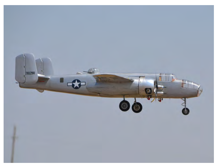
B 25 to Control Tower we have a problem, the run way seems to be on an angle or is that just us.

This B 25 model in full flight looks and sounds very impressive.