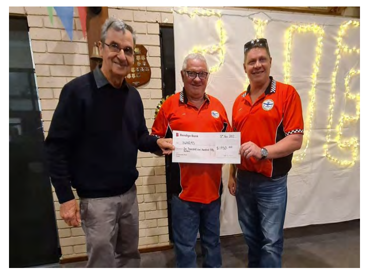
As I was paying the cashier for my Christmas tree, he asked, "Are you going to put that up yourself?"