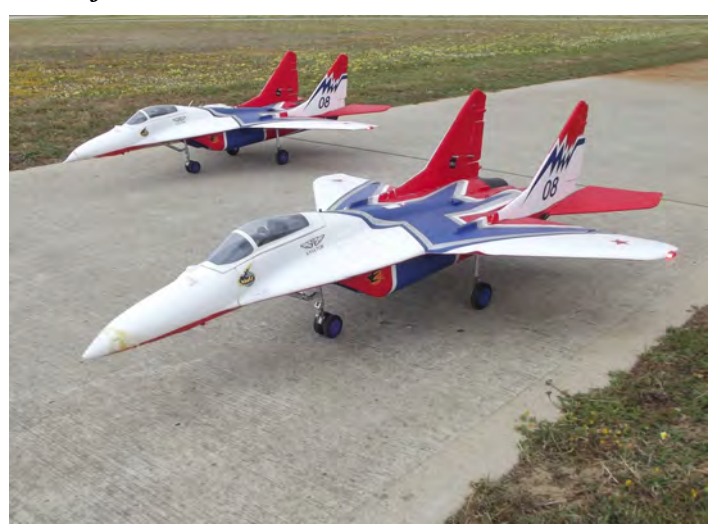
I was very impressed with the resilience of this EDF owned and flown by Bill Darnell, during the day it was observed doing some very unusual landing or should I say arrivals. There were double wing cartwheels, wing tip stalls onto the runway and several that there was really no way of explaining. But at the end of the day it was here still flying after some field repair that proved to be very effective.

Ian Baine and Shane Ballingall teamed up to do a bit of impressive formation flying with these twin aircraft.