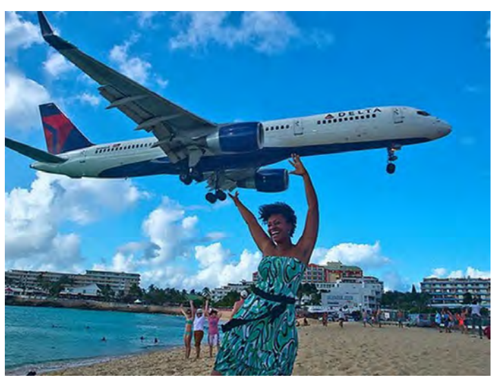
She: Now that we're married you can sell all those Radio Control model planes and we can go travel. He: You're starting to sound like me Ex-Wife. She: You never told me that you were previously married. He: I wasn't

This lady has now been employed to work on Sunday mornings to assist those having problems with this task. She appears to have the necessary skills and will be available during the hours from 9am until 2pm to render assistance where necessary.