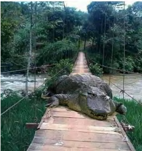
Pretty sure this is the bridge you take to get to 2021..

Like everyone else around the world the club had it's year disrupted and things had to change from normal flying activities, however, apart from the Funfly weekend being cancelled it was just a bit restrictive for around five weeks before flying commenced again with some restrictions still in place.