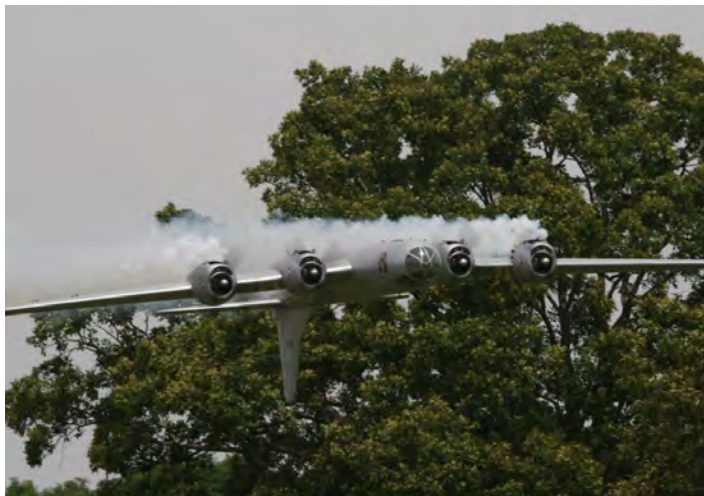
Inverted pass with smoke on is also very impressive, something to think about here Rob.