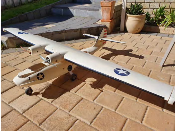
The completed project ready for another trip to the field for a test flight

All the gear had been removed and one motor was seized so I seen it as a challenge to get it back into the sky, it is fitted with two OS 40 nitro motors that needed a bit of work to get them up and running again..