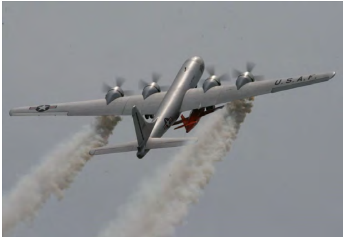
Smoke on makes the model look very impressive as it climbs away from the ground.

Is this something we might see in the future after the maiden flight and the model has been trimmed and performing well. Your smoking it !!