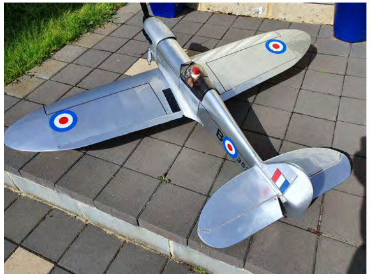
Another Spitfire I have in the hanger fitted with a 70 four stroke motor.

The original colour scheme was military green camouflage which is not available off the shelf now so I elected to go with an all silver look. I found this was also difficult to obtain but was lucky enough to find it in America so placed an order. With the Covid-19 problems we are experiencing it took 9 weeks to arrive, however, that gave me plenty of time to strip the old covering from the airframe and prepare it.