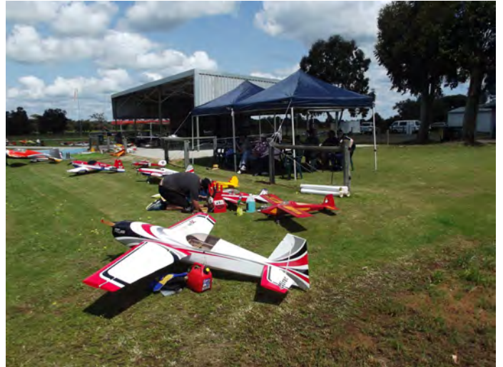
The crowd starting to build up ready to experience some flying displays.