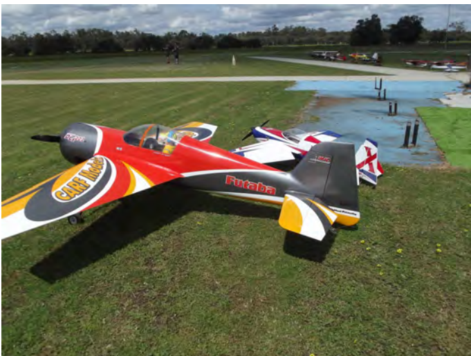
One of the bigger models on display and producing some impressive moves whilst flying.