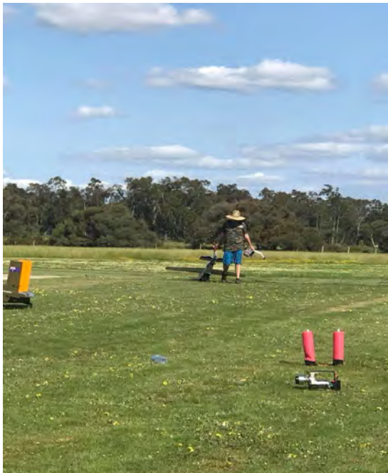
The long walk back to the pits

This IMAC plane dwarfed most of the planes in the sky as it performed a variety on maneuvers over the field.