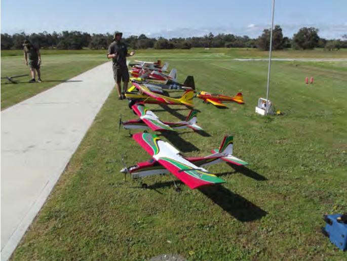
The models were lined up ready for take