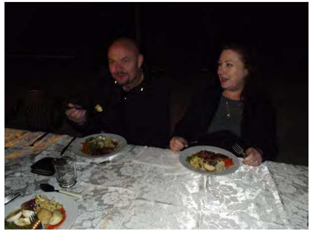
A Women's work is never done.