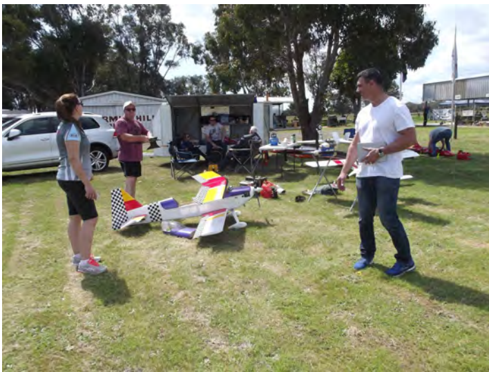
The flight line was a busy place to be during the two days flying, standing room only.

This was their flight line accommodation during the day.