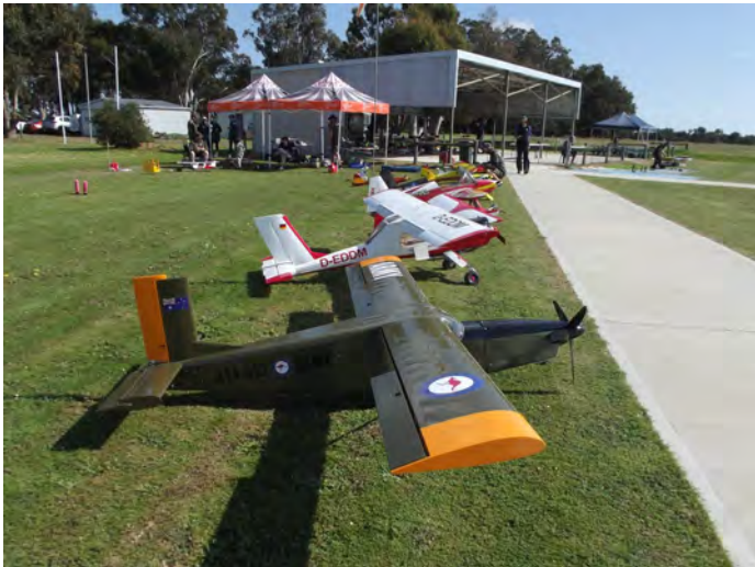
Yes, the Army made their presence felt as this large model graced the sky with some very slow & low passes.