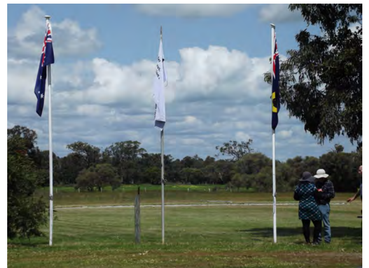
DLE Engines sponsored the event again this year.