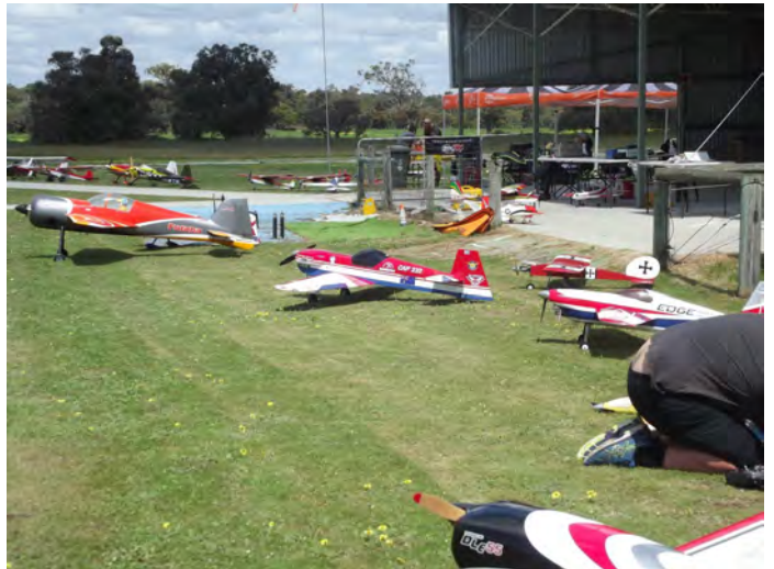
The models were spread out over a large area which enables spectators to have a better view.