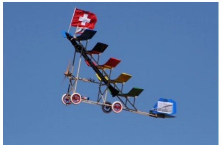
Hey Troy, did they get clearance to use your runway