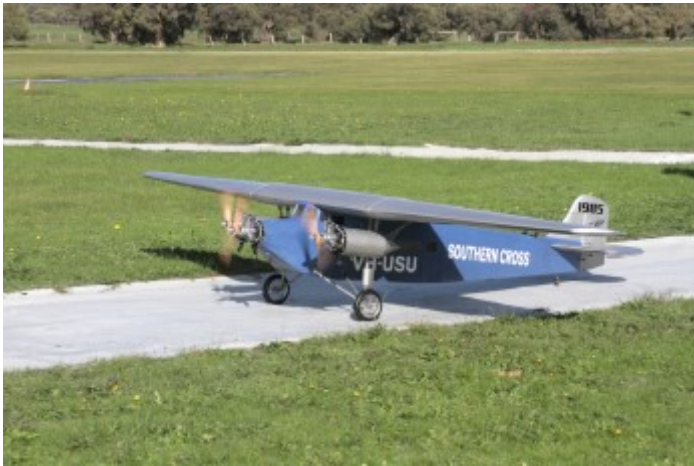
Cleared for taxi.