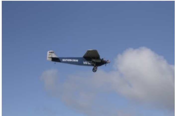
Smithy would be proud of this picture, Southern Cross amongst the clouds again.