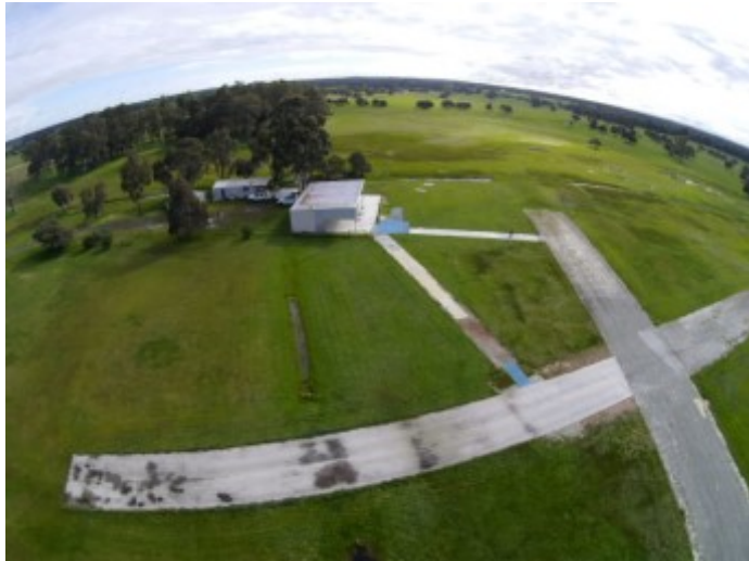
A plane grave yard in the US, this large number of planes are out of service and I would say someone is out of pocket to the tune of millions of dollars.