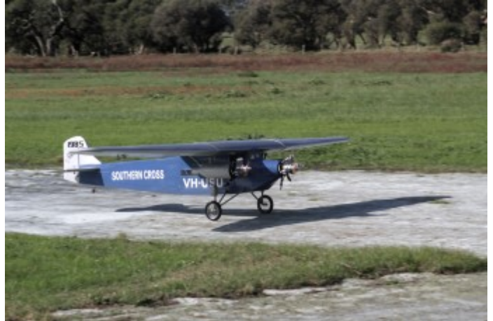
Powering down main runway with tail wheel lift off.