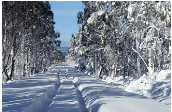
Interesting model that actually flies, could be challenging to trim out.

Access was with four wheel drive vehicles only and it was for a four day period, looks good but only through a vehicle windscreen with the heater on.