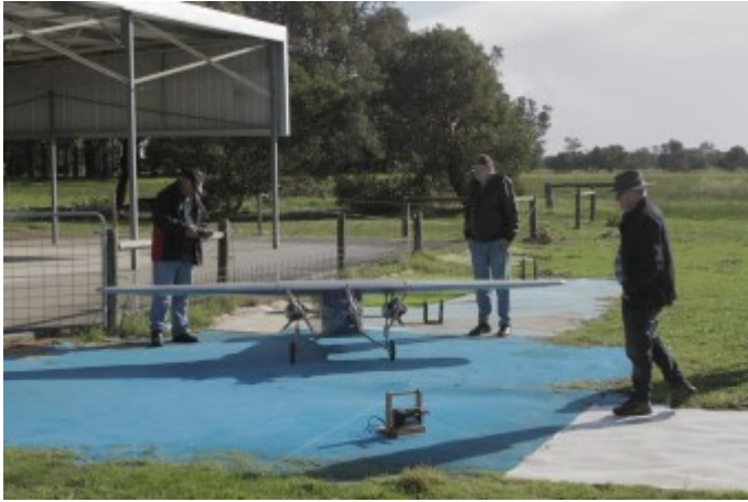
Final check being conducted and motors fired up.