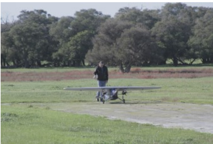
Very last check, with breath held and fingers crossed., will it fly ?