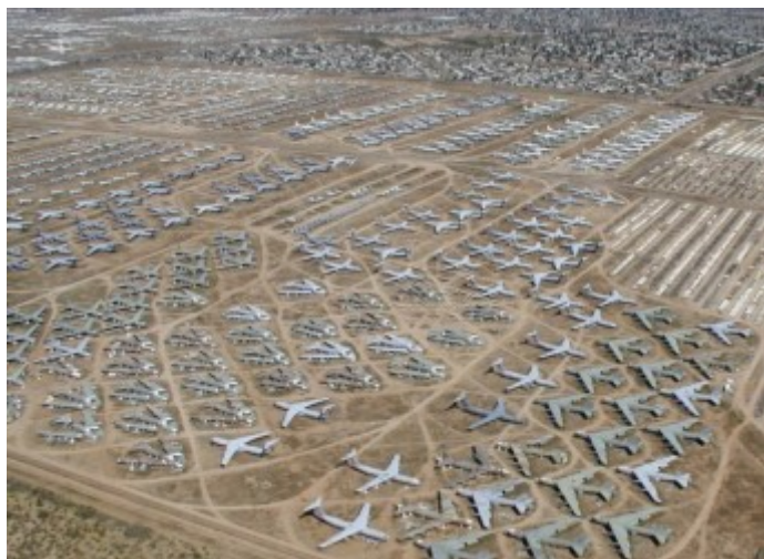
Does not appear that they are used for scrap metal but they must be worth something.

We might of thought is has been cold here recently, spare a thought for my fellow country men and women. This is a photo taken on the highway into the Great Lakes region in central Tasmania last week.