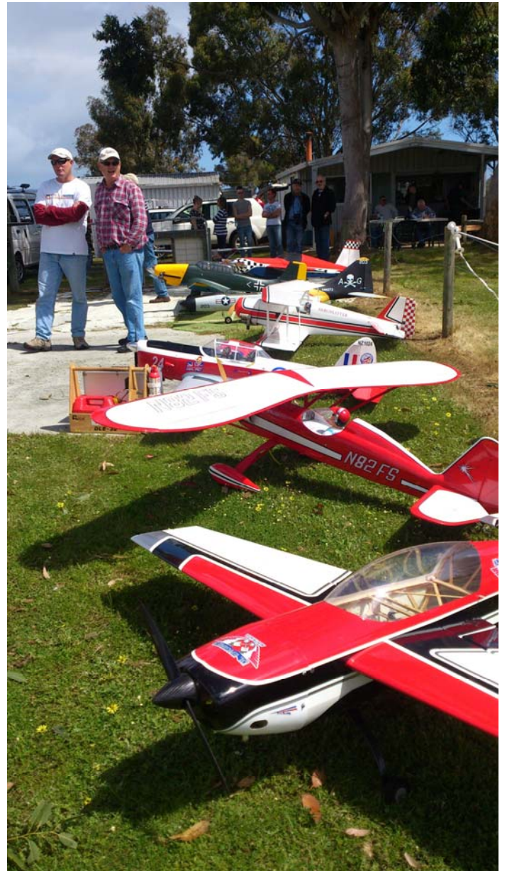
Quite a variety turned up on Sunday