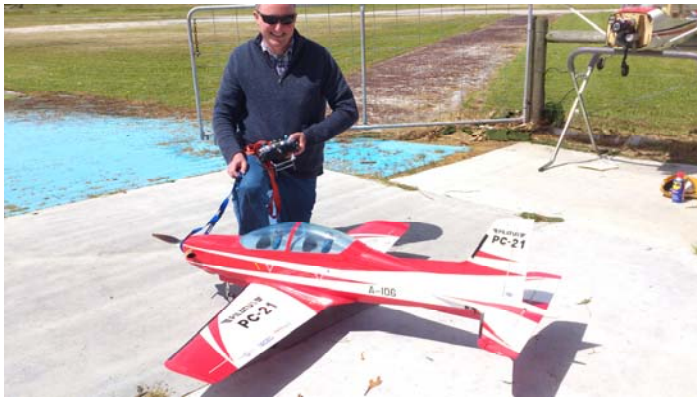
This gentleman's name escapes me, but was his first visit to SWARMS and was impressed with the field, club, facilities and best of all the friendly environment :)