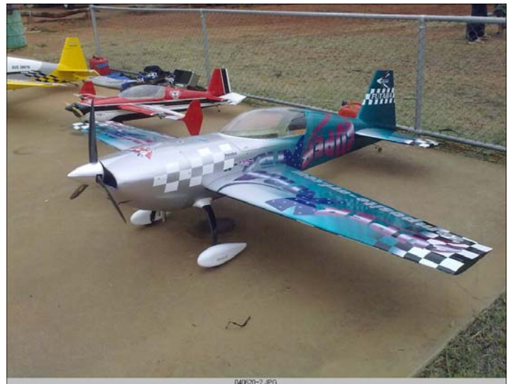
I see by the very conspicuous sign that DL Engines was well represented at the competition.

The worse thing that can happen is you will learn something and improve your flying..... go on ..... I dare you!