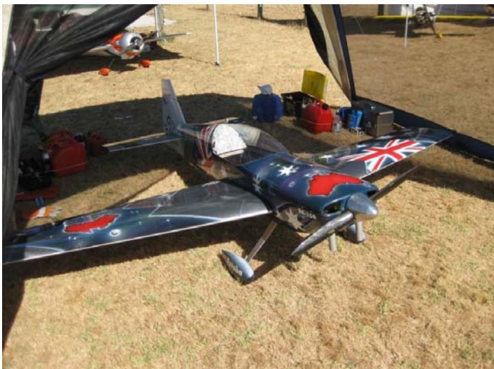
Great colour scheme on this plane.