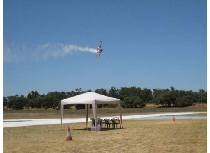
Lunch time flying display.