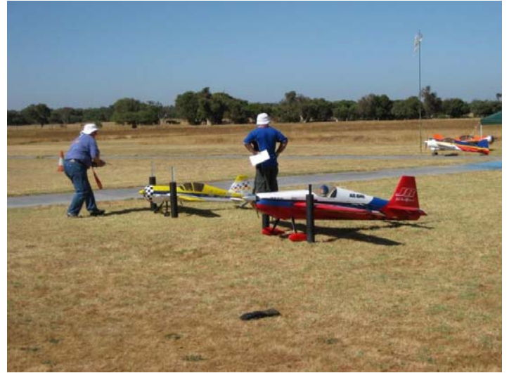
Complete check underway prior to another round of competition.