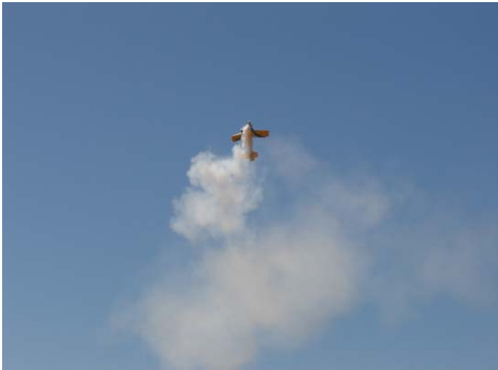
Hanging on the prop with smoke full on.

A couple of action shots of a Bi-Plane smoking up the sky over the field before Christmas. It was powered by a D A 150 motor. The plane was owned and flown by a visitor to the field.