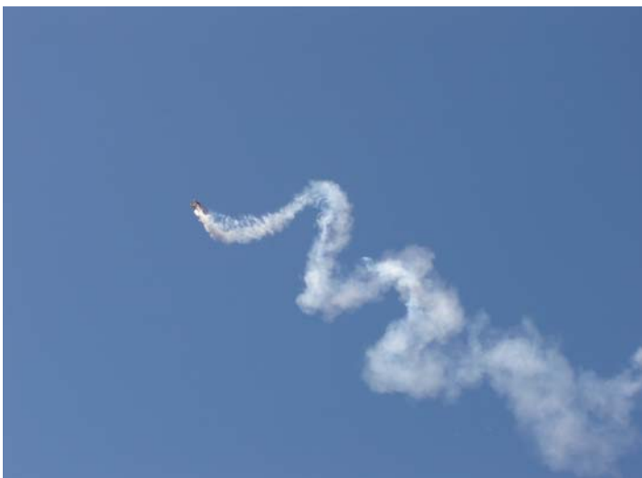
Smoke trail gives clear indication of the progress of the plane.