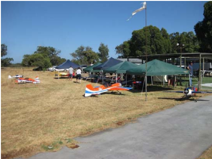
How the field was transformed into tent city for the event, it appears that it is for the benefit of the plane not the pilot