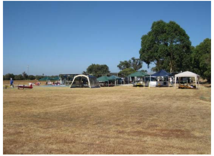
More of the portable plane hangers in front of the pits.