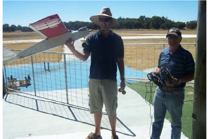
Scotty back after a training session minus the landing gear, this is not a good start when teaching new members the fine art of flying. The aim is to return with all components of the plane intact.