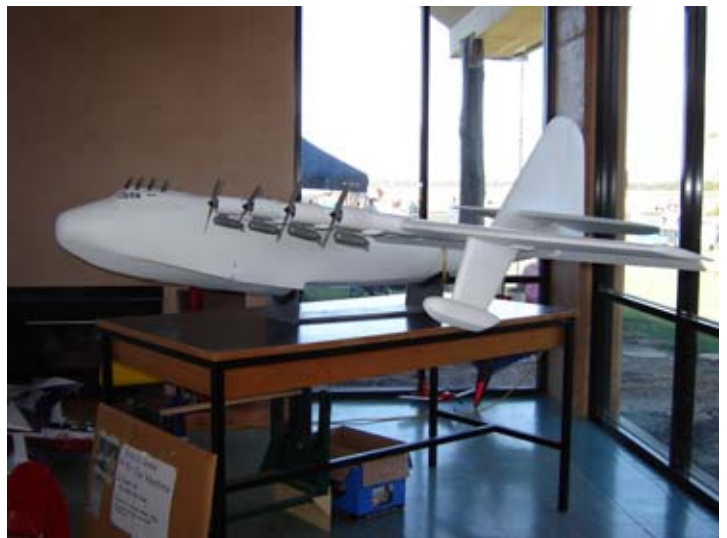
Starboard side view