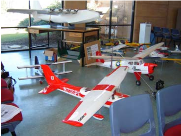
Couple more pics of the display at the flyin.