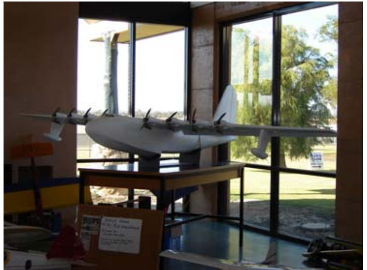
Port side views

The attached photos show the "Spruce Goose" in all it's glory, from all angles, dwarfing the other planes on display on the day.