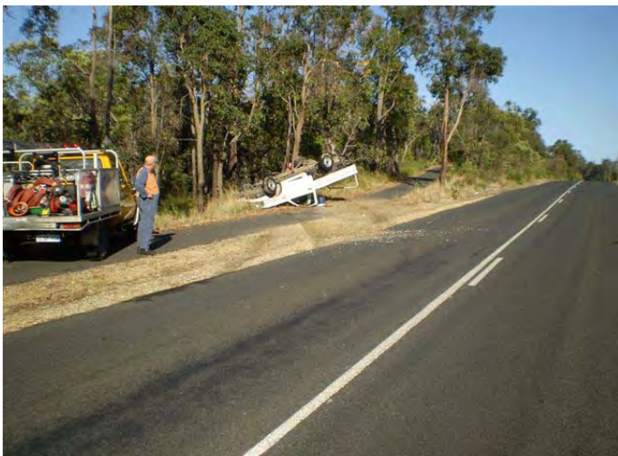
Missed the runway completely