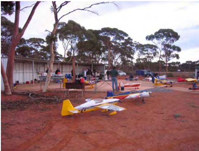
Looking at a variety of planes that competed on the day and the pit area.