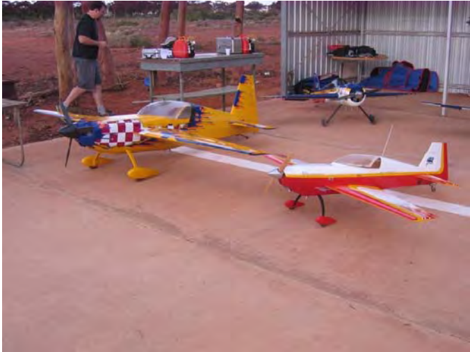
Certainly looking at boys with "BIG" toys when you look at some of these pictures.