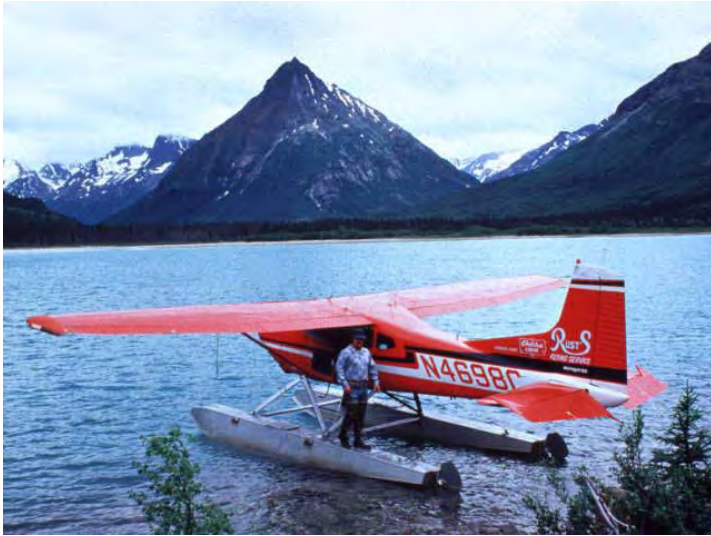
Looks like another good location "Woody"

Before you criticize someone, you should walk a mile in their shoes. That way, when you criticize them you're a mile away and you have their shoes.