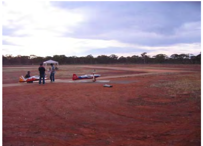
Plenty of that red dirt around here.