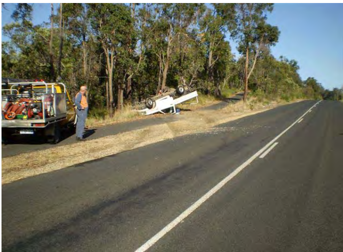
Missed the runway completely