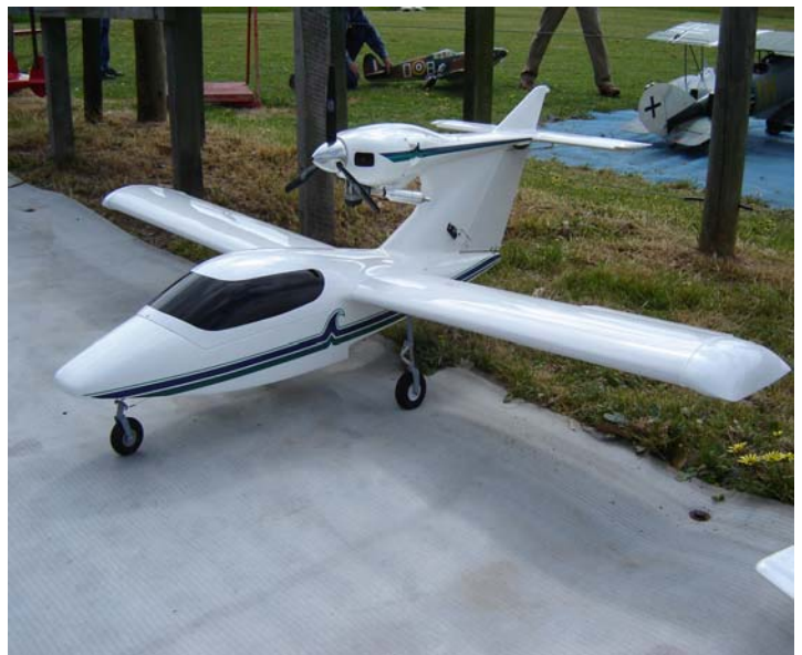
Ian's pride & joy