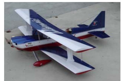
Greatplanes Ultimate Bi-plane